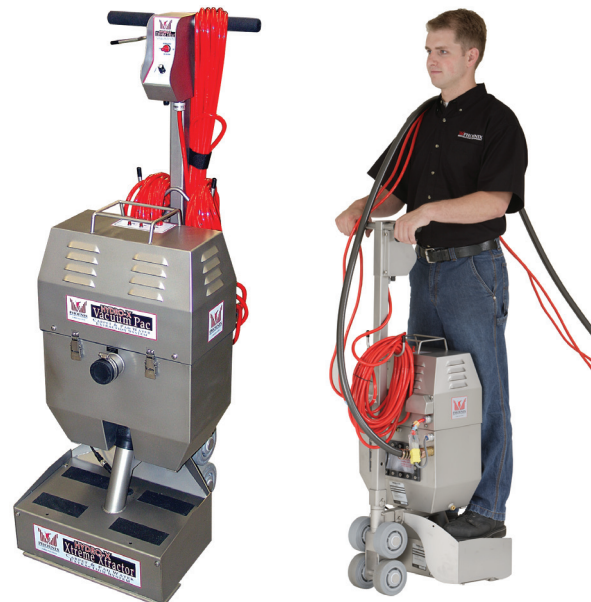
Phoenix Hydro-X Vacuum Pac PN 4025601